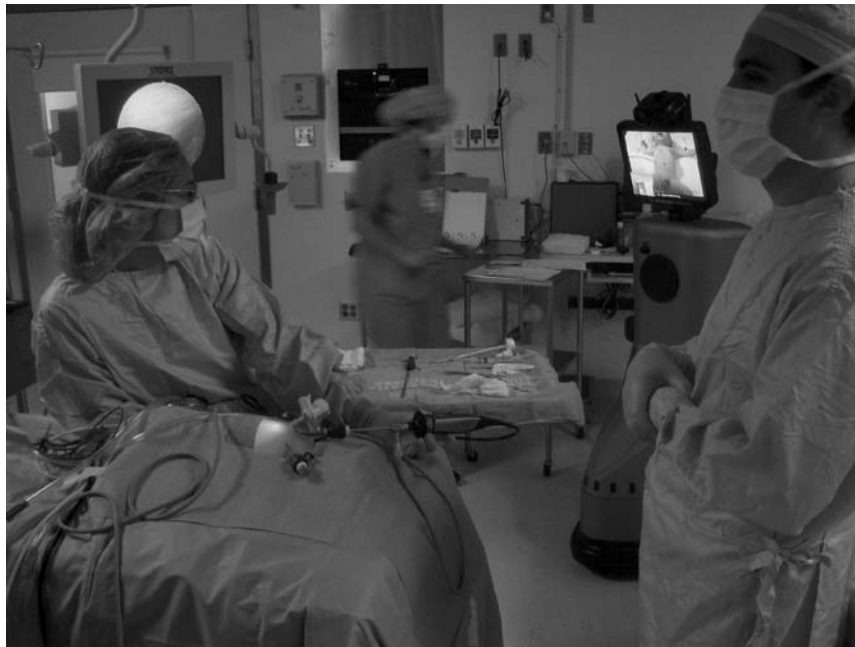
FIG. 1. The RP-7 present in the operating room during a laparoscopy on a neonate with duodenal atresia. The robot is positioned to allow visualization of the patient and the camera monitors.

The rapid evolution of emerging surgical technologies and procedures has necessitated that surgeons rapidly assimilate and train in a varying array of new procedures. This has been especially evident in the field of MIS. A large numbers of hands-on courses, teaching aids, video files, and mentoring programs have been developed to help surgeons learn and assimilate these techniques. 3 However, there is a well-recognized disconnect between a surgeon taking a training course or a mini-fellowship and successfully applying these techniques in their practice. Having an on-site mentor to help bridge this training gap is an effective technique but is often not logistically or economically feasible. This is especially true in a highly specialized field where there are few expert mentors, or the frequency of a specific case is rare. It is also