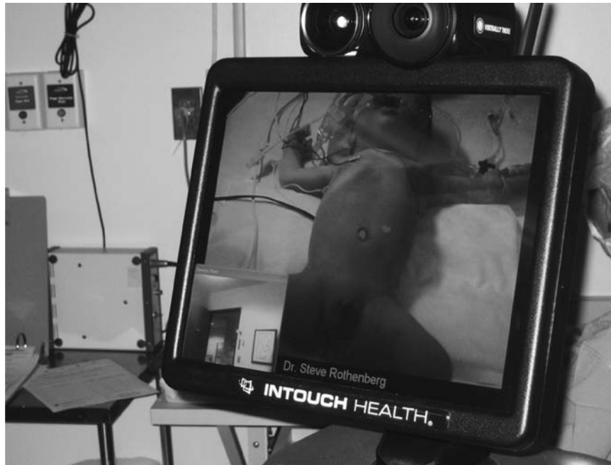
FIG. 2. Recommended trocar placement is demonstrated by the mentor on the robot's flat panel monitor. The picture is captured by the robot's camera, modified by the surgical mentor, and transmitted back to the operating room.

very difficult to arrange if the cases are of an emergent or semiemergent nature, such that time restraints do not allow a mentor to be on site.