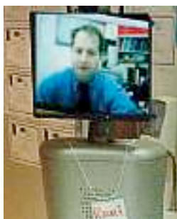
Figure 1. Robotic Telepresence